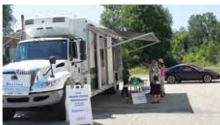
Benton Harbor's Mobile Pantry program has seen a large expansion over the last year, thanks to grants from the Walmart Foundation, the Upton Foundation and others.